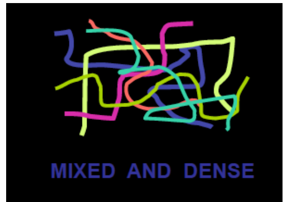
"The spaghetti city" based on complexity". Slide: Christer Larsson

Territorial associations such as the Regional Plan Association of New York or Deltametropool in the Randstad have been established to identify the scales at which current challenges function and to conduct objective research to conceptualise the public benefit of projects and articulate the relation between different projects. Through such associations change can be influenced and solutions identified to tackle challenges; they identify infrastructure investment that enables the region; support or oppose visions; predict places where future development might come; and create the connection between the different planning agencies.