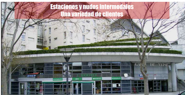
Stations as spaces of interaction. Slide: Stéphane Cobo

Mixing functions (employment, residential, entertainment, retail) can create commuting systems that operate in both ways, spreading activity over the area. Models where people live far from work are unsustainable. We can provide housing closer to workspaces and workspaces closer to housing. Flexible workspace, where facilities, such as video conferencing are made available, can be foreseen in spaces of interaction, or the "Fourth Urban Space" (Christer Larsson); spaces where life, work and public services come together. These spaces will make it possible for people to move less and combine modes of transport.