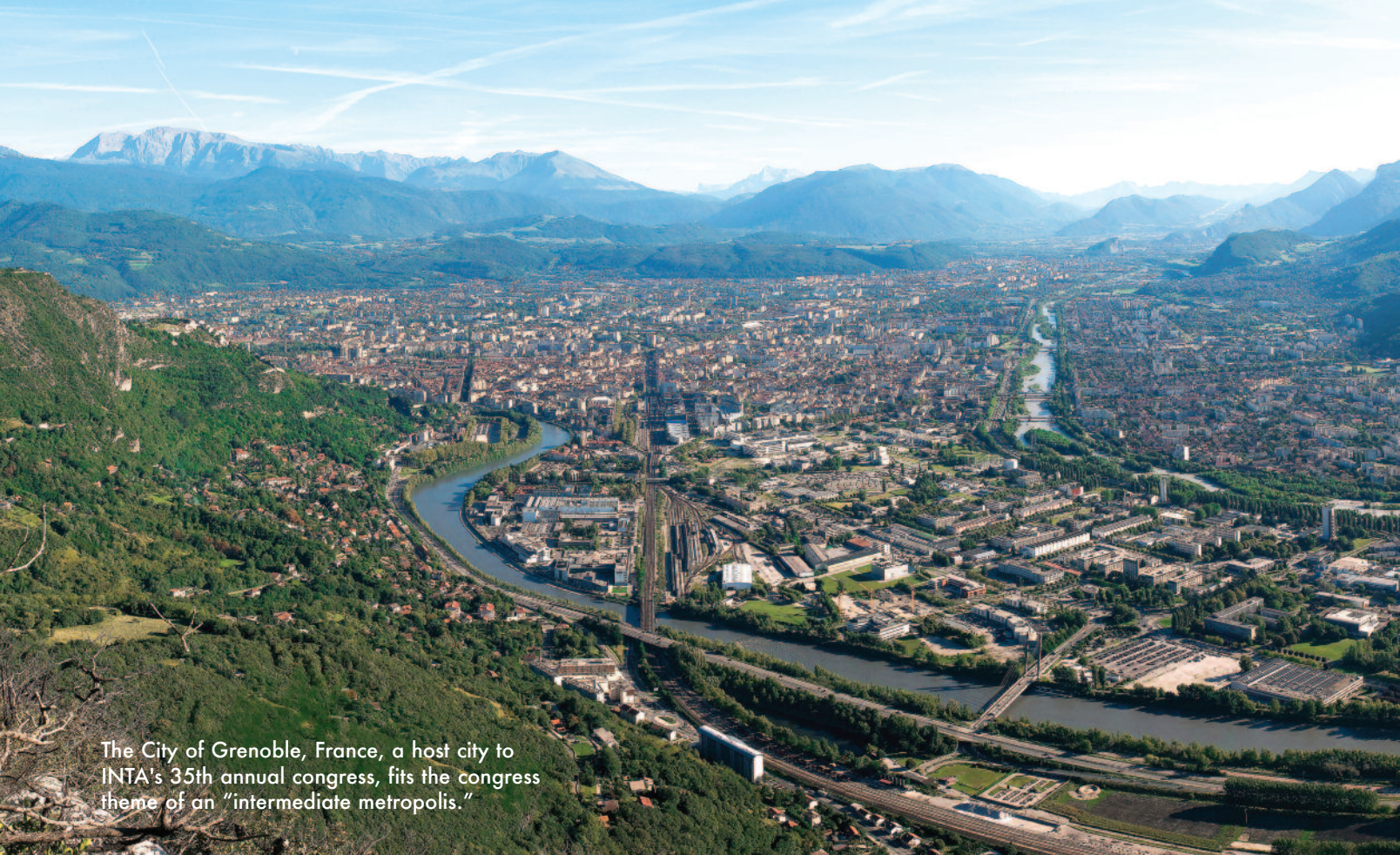
The City of Grenoble, France, a host city to INTA's 35th annual congress, fits the congress theme of an "intermediate metropolis."