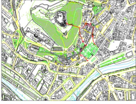
City centre accessibility.

The involvement of the residents and of all the stakeholders has allowed the project to go on and move forwards, dealing with contrary interests, turning intention into a project supported by the local population.