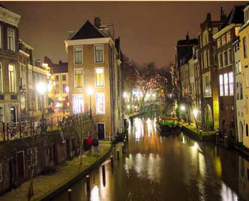
The Utrecht Canals

The City of Utrecht is one of the four major Dutch cities, complementary to each other and forming the Randstad. The station is a national, regional and local transport hub through which over 120 million people pass every year. The station acts as a link between the medieval city centre and the recent development of 30,000 new homes on the far side of the rail tracks.