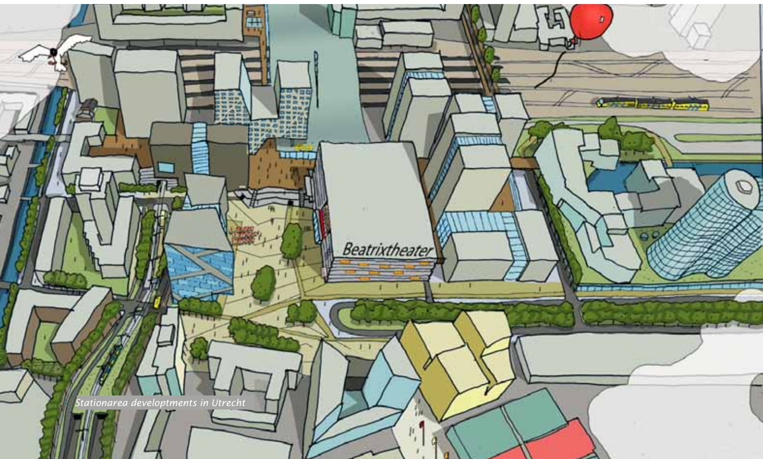
Stationarea developments in Utrecht