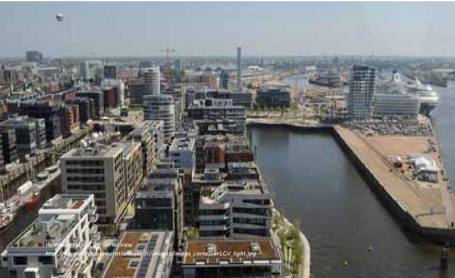
Hamburg Hafen City aerial view http://www.bordeaux-auratlantique.fr/images/image_carrefourLGV_light.jpg