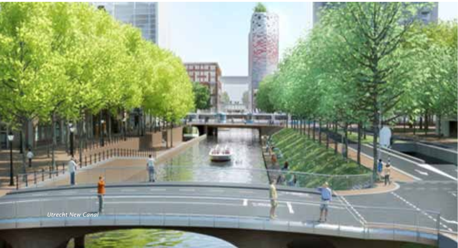
Utrecht New Canal

Bordeaux , a proud trading centre from the past, and distinctive regional centre, over the last two decades has revitalized and given new identity to its fine historic centre through the construction of 47 km of tram network and associated public realm design. In 2017 the high speed rail to Paris (2 hrs) will be completed, with a second phase to Madrid (3.5 hrs) in 2020. The construction of the tram system has given confidence in the role that transport investment can have in stimulating the economy and improving the quality of the environment. The second phase reflecting the national connectivity of the city, is a station redevelopment site and regeneration of the surrounding markets and waterfront, combined with a plan for 50,000 homes associated with the expansion of the tram network, and used as a catalyst to re- envision and create identifiable places in the low density, car focussed, metropolitan hinterland.