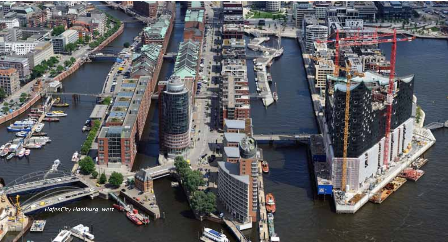
HafenCity Hamburg, west

HafenCity Hamburg , is a project of immense ambition, to integrate the 157 hectare, enclosed Freeport site, back into the fabric of the existing urban heart. Since 2004 with the establishment of HafenCity GmbH a 100% subsidiary of the Free and Hanseatic City of Hamburg, the area has become a destination with 1,800 residents, 8,500 jobs and over 300 businesses. HafenCity building fast is more than a building site, it is equally concerned with economic and social development. It is innovative in its approach, focussed on quality, learning through evaluation, reflection and feed back. HafenCity is an exemplar of integrative, collaborative working, and a yardstick against which to measure other projects.