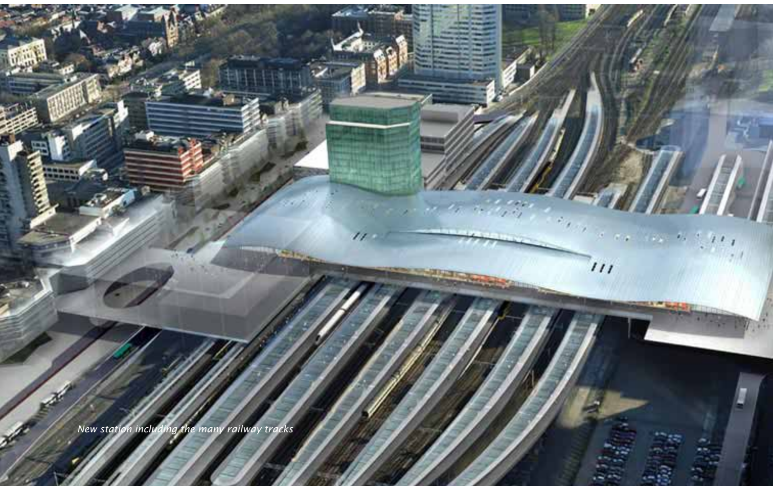
New station including the many railway tracks