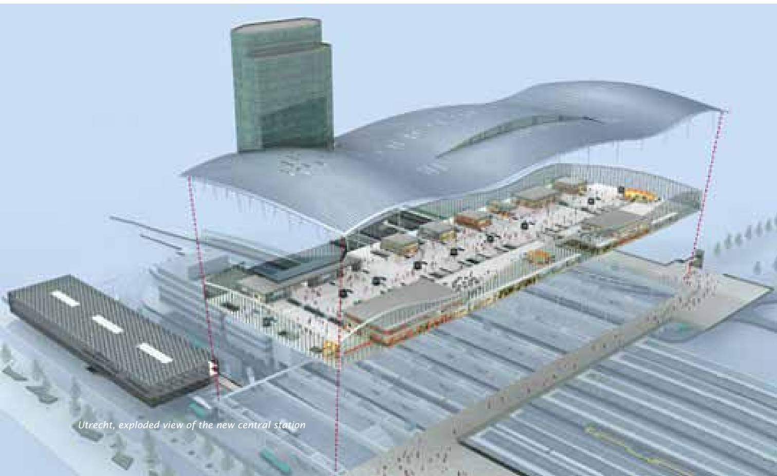
Utrecht, exploded view of the new central station

and contact us at: info@learningcitiesplatform.eu