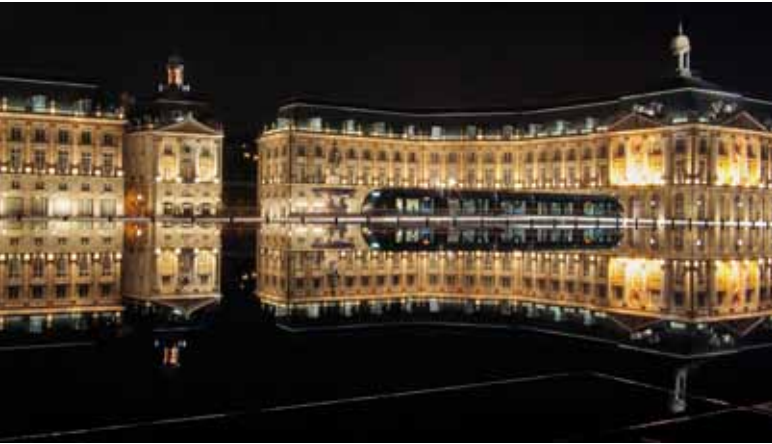
Bordeaux, new riverfront

HafenCity Hamburg , is a project of immense ambition, to integrate the 157 hectare, enclosed Freeport site, back into the fabric of the existing urban heart. Since 2004 with the establishment of HafenCity GmbH a 100% subsidiary of the Free and Hanseatic City of Hamburg, the area has become a destination with 1,800 residents, 8,500 jobs and over 300 businesses. HafenCity building fast is more than a building site, it is equally concerned with economic and social development. It is innovative in its approach, focussed on quality, learning through evaluation, reflection and feed back. HafenCity is an exemplar of integrative, collaborative working, and a yardstick against which to measure other projects.