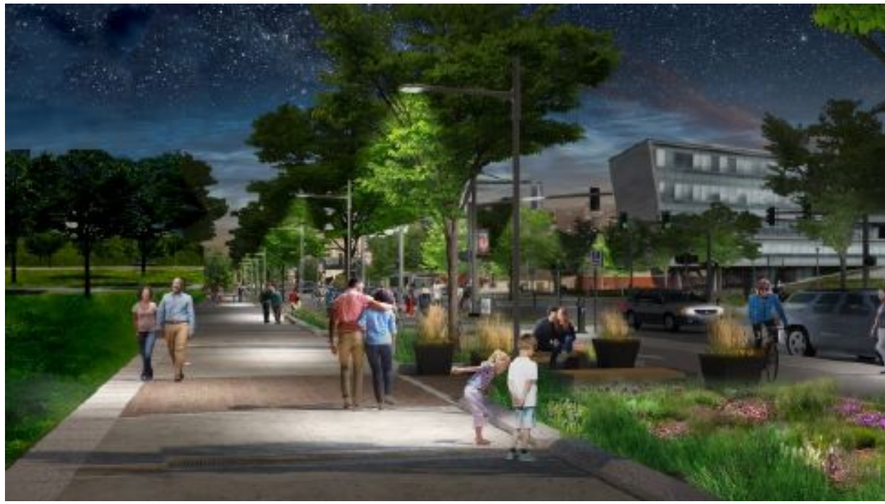
A rendering of the Community Grid proposal along Almond Street, Syracuse. NYS DOT