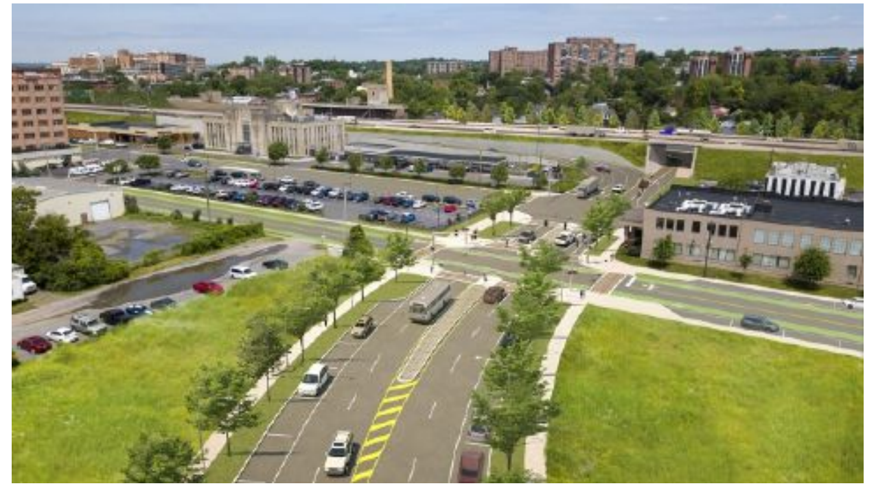
The reimagined Crouse Avenue at I-690 Interchange.

As a result of widespread discrimination, redlining, and Jim Crow-era segregation, an almost exclusive concentration of 90% of the Black population in Syracuse, New York, lived in the 15th Ward. Towards the mid-20th century, the 15th Ward quickly became a refuge from discrimination: a vibrant, close-knit, working-class community. It was also a frequent stop for Black travelers as a safe haven from “white-only” establishments. 00 But with the birth of the Federal-Aid Highway Act of 1956, Syracuse’s urban renewal programs called for the 15th Ward to be reborn as a government complex, cultural center, and high-rise residential neighborhood. Community members were initially hopeful. They believed the plan would lead to better housing, more city-wide integration, and a chance to improve their lives. It soon became apparent that that wouldn’t be the case: the 15th Ward was completely demolished, an estimated 1,300–2,200 families were permanently displaced, and the newly constructed Interstate 81 now ran through its center. 00